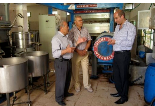
One hundred field staff members—all of whom are from the regions in which they serve—are the primary source of innovation and effectiveness in NEF's work.

For nearly 100 years, NEF has worked to create more sustainable, prosperous, and inclusive communities through education, governance, and economic development initiatives. Since NEF's founding in 1915, we have transformed tens of millions of lives in nearly 40 countries throughout the Middle East and Africa.