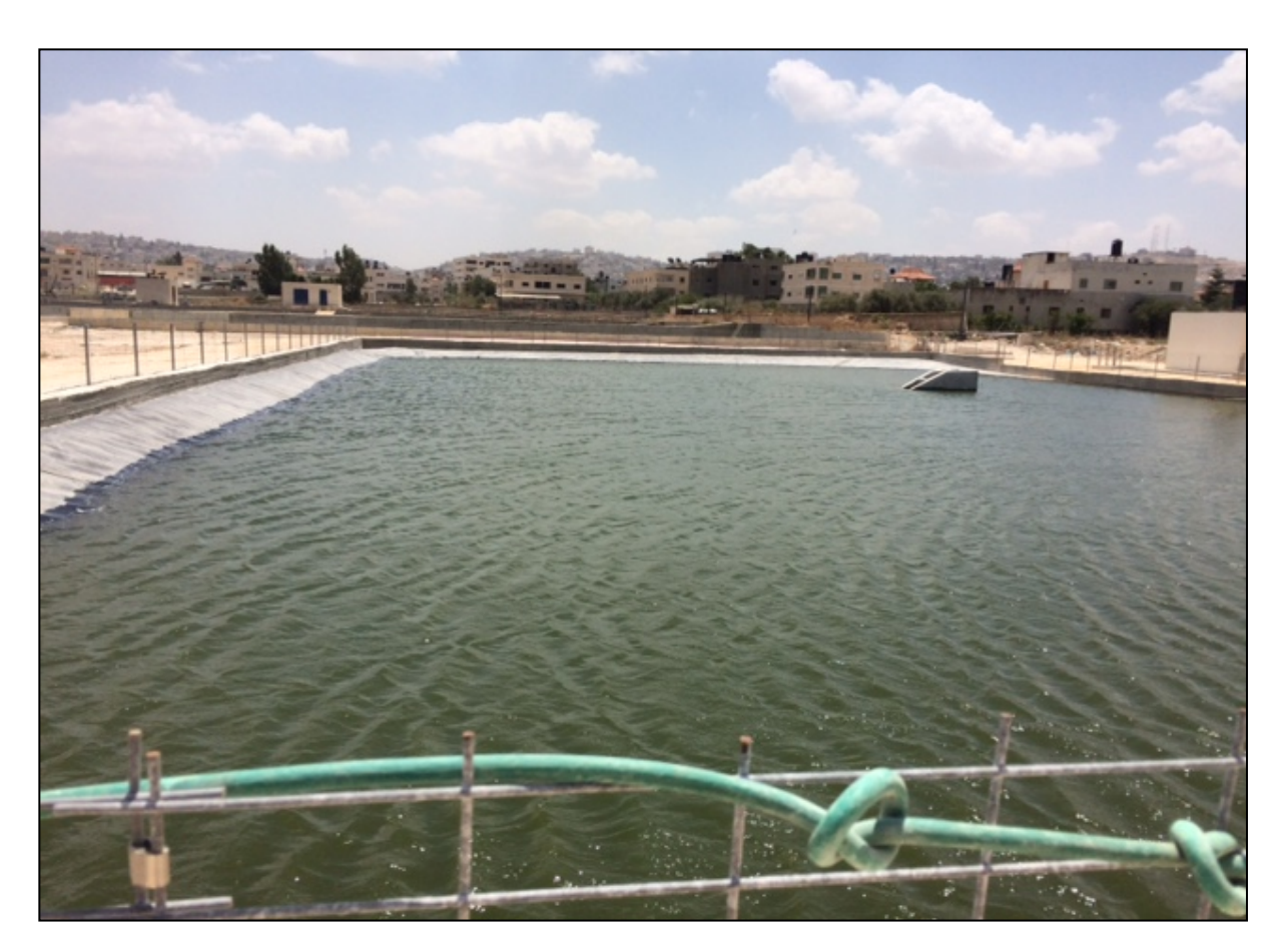
Earth pond reservoir constructed by ANERA through funding from OFID.

Water Distribution System. The project installed a water distribution system to distribute treated water to targeted farms. The distribution system includes 5200 meters of 99mm High-Density Polyethylene Pipes (HDPE) and 1000 meters of 75mm HDPE pipes, all rated at 10 bars. Following local specifications and international best practices, the pipes are all light purple in color to distinguish the water carried from potable water. The water distribution system also includes gate valves and water meters at all farms served to allow for optimal operation, control, and the measurement of flow.