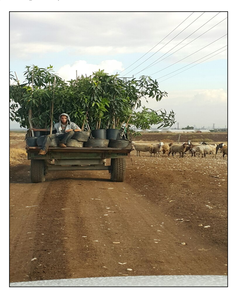
Avocado and mango seedlings are transported for planting.