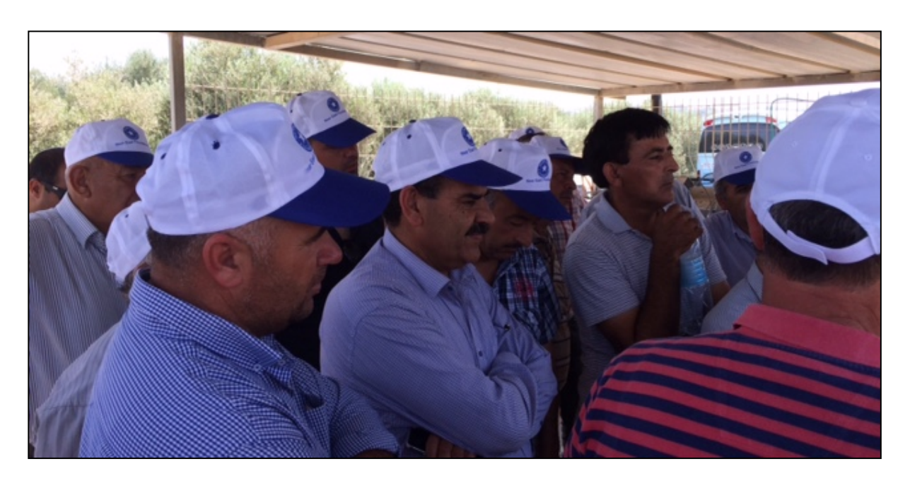
Farmers during visit to treatment plant in Israel.