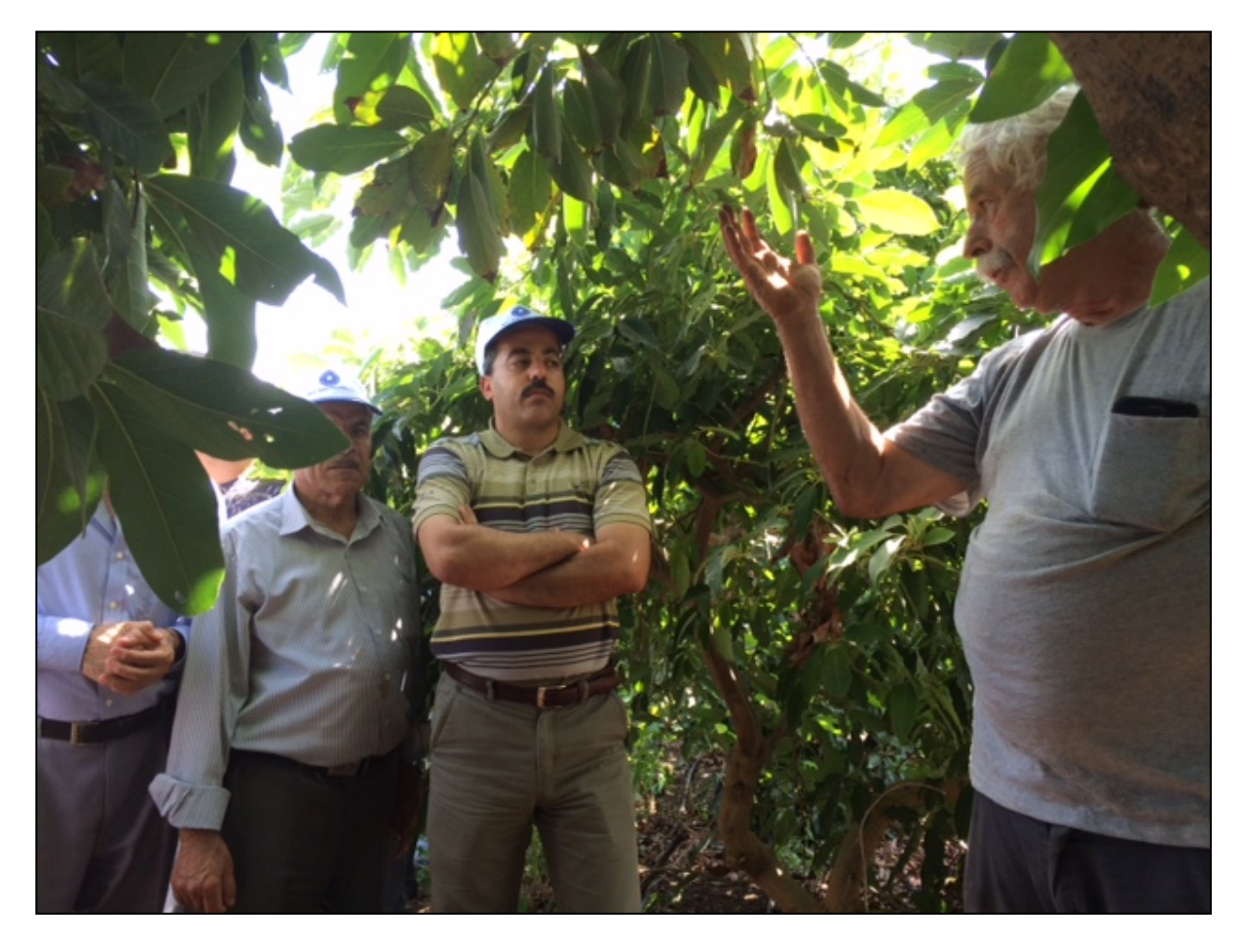
Farmers during study tour to Israeli avocado farm.