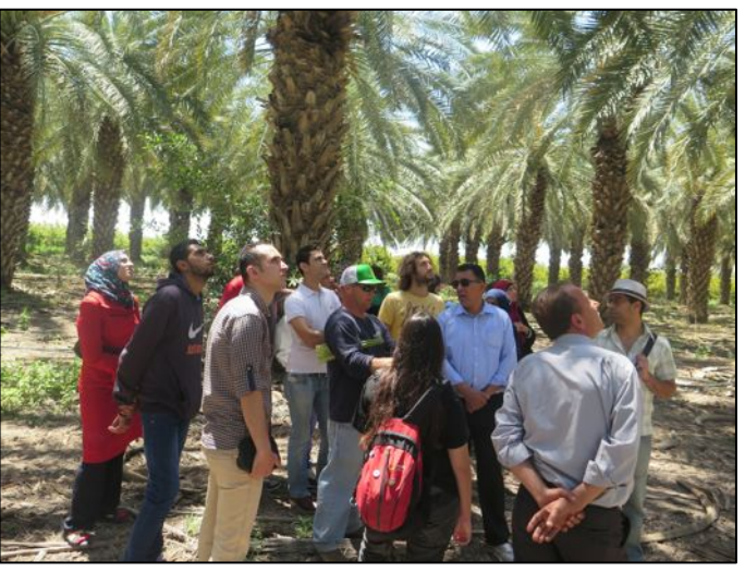
Members of the Palm cohort tour a date farm as part of the their study tour.

Follow-up Joint Debriefing Session/Study tour: On April 30, 24 palm cohort participants (16 males and 8 females; 9 Israelis and 15 Palestinians) visited two sites as part of a study tour. The first site was a date farm in Area B of the West Bank, which is under Palestinian civil administration with retaining exclusive Israel security control (with limited cooperation from the Palestinian police). The owner of the date farm explained the fertilization and branch-reduction methods utilized in his farming operations to the project participants.