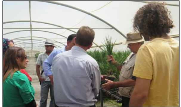
Palm cohort participants listen attentively as palmcloning techniques are explained at the Zehevli Nursery.

Activity 1.3: Assist 120 training participants to develop 60 business plans for cross-border agricultural enterprises.