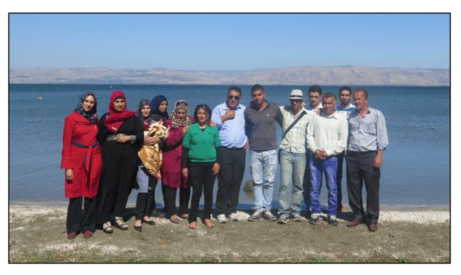
Members of the palm cohort take a group photo during their study tour.