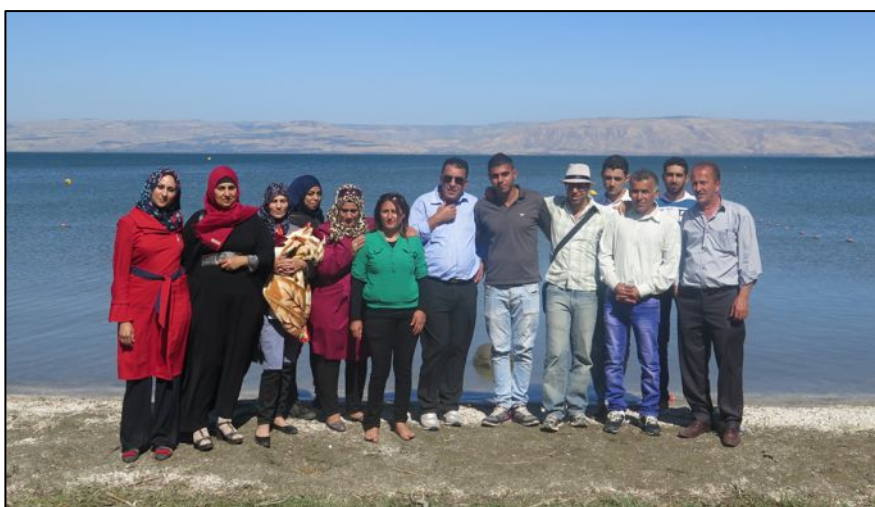
Members of the palm cohort take a group photo during their study tour.