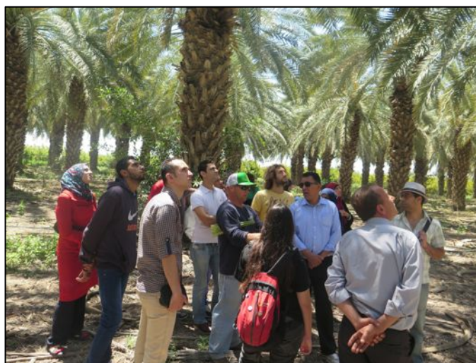
Members of the Palm cohort tour a date farm as part of their study tour.

Follow-up Joint Debriefing Session/Study tour: On April 30, 24 palm cohort participants (16 males and 8 females; 9 Israelis and 15 Palestinians) visited two sites as part of a study tour. The first site was a date farm in Area B of the West Bank, which is under Palestinian civil administration with Israel retaining exclusive security control (with limited cooperation from the Palestinian police). The owner of the date farm explained the fertilization and branch-reduction methods utilized in his farming operations to the project participants.