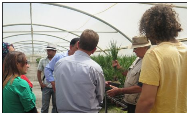
Palm cohort participants listen attentively as palm-cloning techniques are explained at the Zeheveli Nursery.